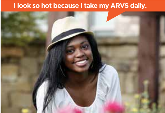
That's my way of stopping HIV. WHAT ABOUT YOU?